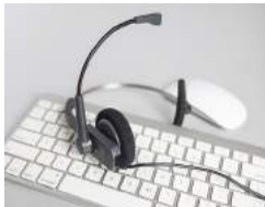
Galaxy Plus Monaural