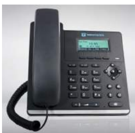
Galaxy 1000 IP Phones