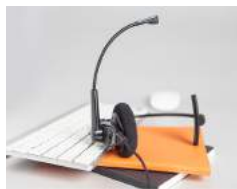
Galaxy Pro Monaural