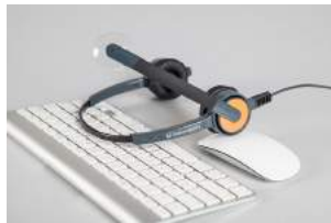
Celesta Uno Binaural