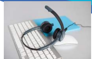
C Plus Binaural