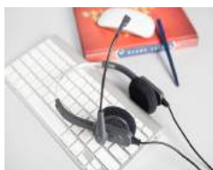
Galaxy Plus Binaural