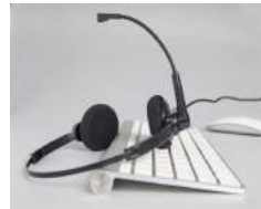
Galaxy Pro Binaural