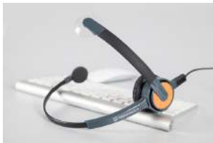
Celesta Uno Monaural