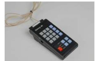
TLK Galaxy 40