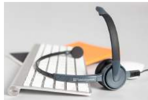
C Plus Monaural