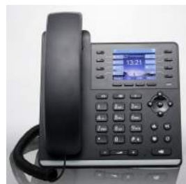
Galaxy 1000 Plus IP Phones