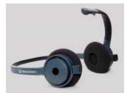
Enterprise Bluetooth Headsets